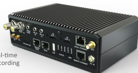
Full HD 1080p real-time streaming and recording